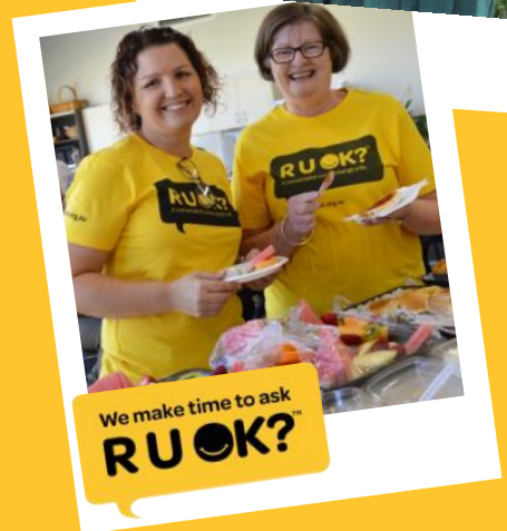
We make time to ask RUOK?