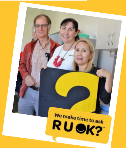
We make time to ask RUOK?