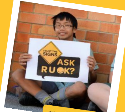
We make time to ask RUOK?