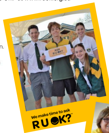
We make time to ask RUOK?