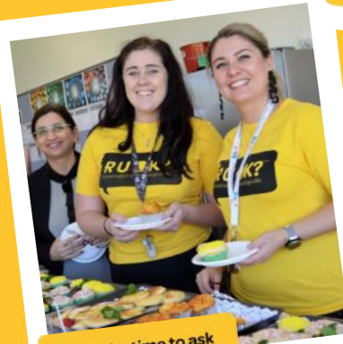
We make time to ask RUOK?