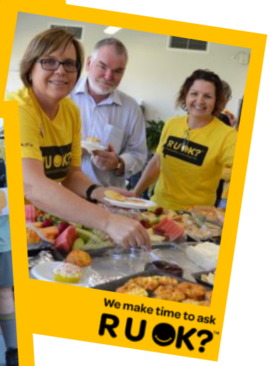
We make time to ask RUOK?