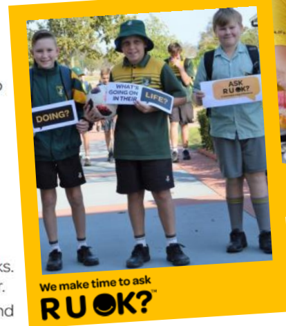
We make time to ask RUOK?