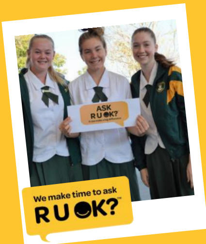
We make time to ask RUOK?